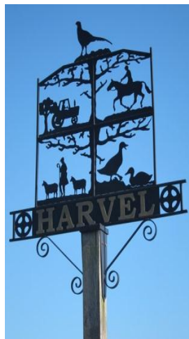
Harvel Village Hall – 100 years old